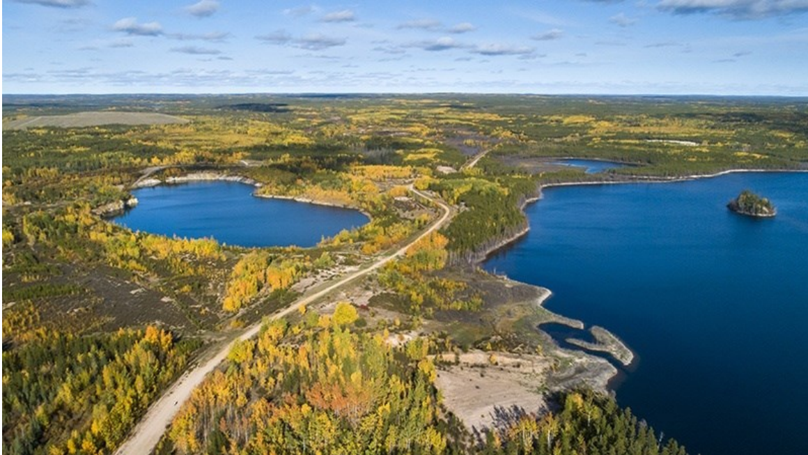
Cluff Lake as it is today

The Canadian Nuclear Safety Commission (CNSC) has revoked the uranium mine licence held by Orano Canada Inc for the fully decommissioned Cluff Lake Project in northwestern Saskatchewan, clearing the way for Orano to transfer the site to the Province of Saskatchewan - a first for any modern uranium mine in Canada.